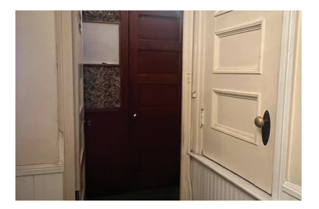
STEP 3: Head to this doorway to the back stairwell that goes up to the 2nd floor landing area.