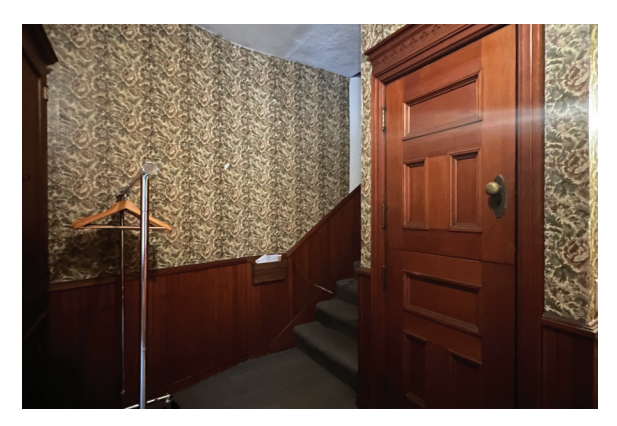
STEP 5: Turn RIGHT at the landing to continue up the last flight of stairs to the Third Floor.