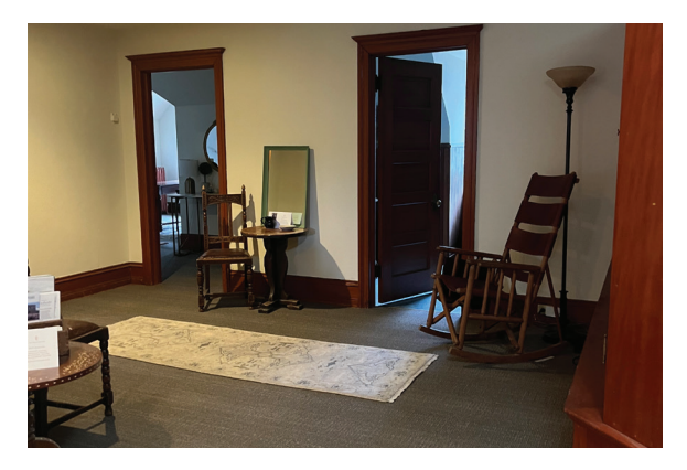
STEP 6: Welcome! You've entered the common area. The bathroom is on the RiGHT next to the rocking chair The Trunk Room entrance is located near the kitchen by the tea and wter station..