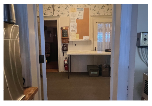
STEP 2: Head RIGHT towards this kitchen doorway to the left of stove. Enter service hallway and turn LEFT to go up the ser