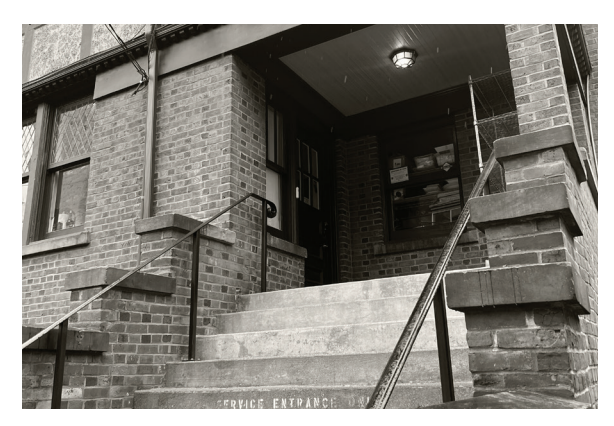
STEP 1: Enter via Service entrance in the alley at back of house. Enter Visitor Code 8051 at Keypad.