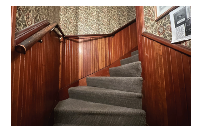
STEP 4: This is the short, but steep stairwell to the 2nd floor. Continue winding to the RIGHT all the way up.